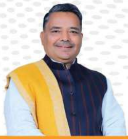
Sh. Jaiveer Singh Ji Hon'ble Minister, Dept. of Culture, Govt. of U.P.