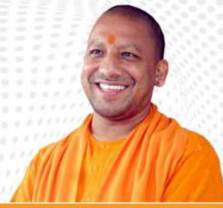
Sh. Yogi Adityanath Ji Hon'ble Chief Minister Govt. of U.P.